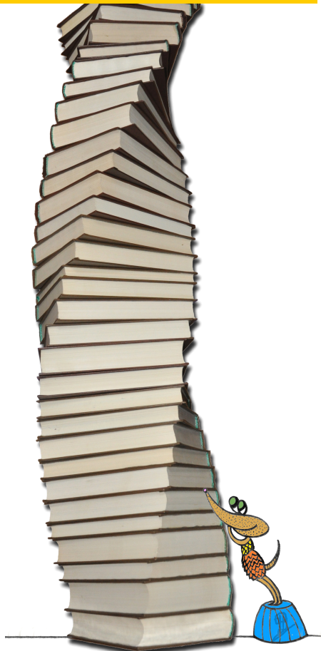
Illustration by Deepthi Horagoda

By continuing to buy and read books, we can help authors and illustrators to continue to create more books for our enjoyment.