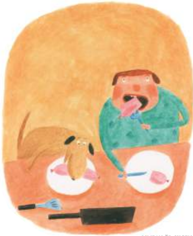
LIMPAN ÄR SUGEN

Younger children find lots to enjoy in Limpan är sugen (Sizzles is Peckish, 1997), a picture story with no words, about a little dog with a craving for sausages and the picture book En fågeldag (A Bird Day, 2000) about Bosse and Lena, a brother and sister, who do a lot of thinking and play some quite wild games. This motif – children’s wild and not always wholly