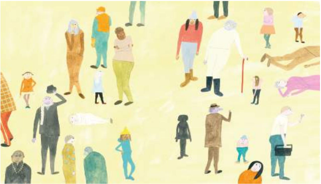
HIT MED VÅRA MÖSSOR!

ity we cannot keep under control, where things disappear and reappear, where trees leave and come back, where we go on a trip and suddenly the atlas is not useful anymore. For your characters everything seems possible. Is that so? Why?