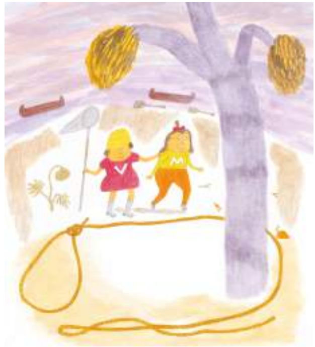
VILMA OCH MONA SPANAR OCH SMYGER

We encounter the same tone and the same frenetic activity in a number of Lindström's other books, where children's wild games provide insights into children's concrete thought processes, described by Piaget as 'transductive': children jump from one specific thing to another in an entirely unpredictable way. In Lindström's comically absurd picture book Vilma och Mona spanar och smyger (Vilma and Mona Go Sneaking and Spying, 2002), the two girls are caught up in the world of their own imaginations. They hunt out things that seem to be lost, or misplaced, and even some that are not yet lost, but look likely to be. They want to 'help' at all costs. They pinch an orange cap from an old man's head. 'We could see a mile away that the cap was missing. The cap had vanished. We could see that, plain and clear. And they find another man, on a bench, and move him because he looks lost: