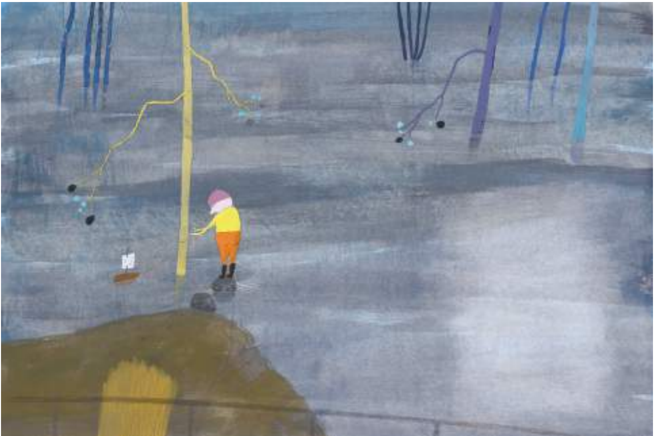
JAG TYCKER INTE OM VATTEN

I think it is a mix of coexistence and insecurity in the pictures. Where are we? What are we doing? And I also think that the coexistence between nature and the characters is perhaps a way of fixing one spot where one can take a deep breath and feel a bit hopeful. I try hard to be hopeful.