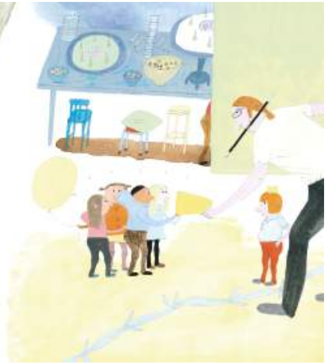
HIT MED VÅRA MÖSSOR!

as a reference is the films by the Kaurismäki brothers.