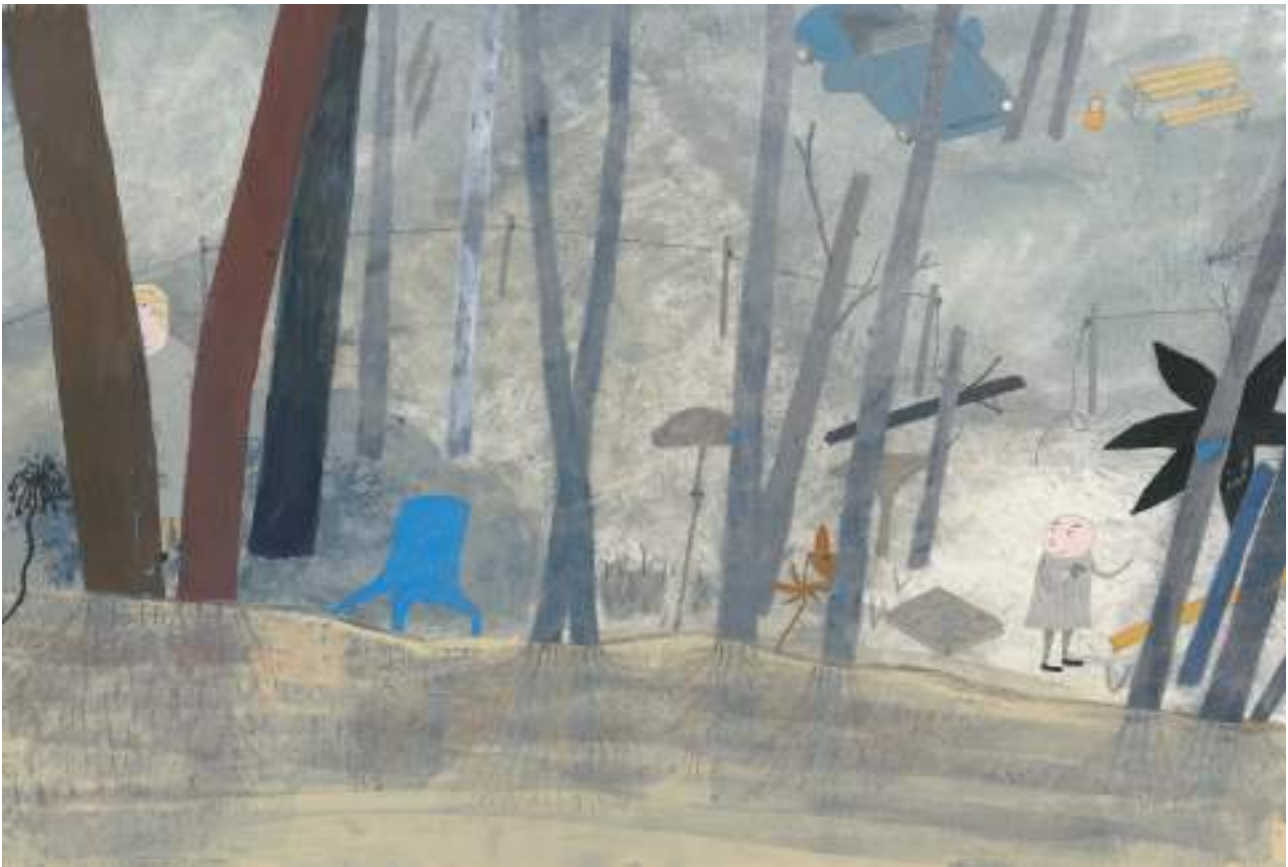
OLLI OCH MO

Mo starts the car. She puts her foot on the accelerator and they zoom off. 'Where are we?' she cries after a while. Olli leafs through the road atlas. 'We'll soon be on the outskirts of page three.