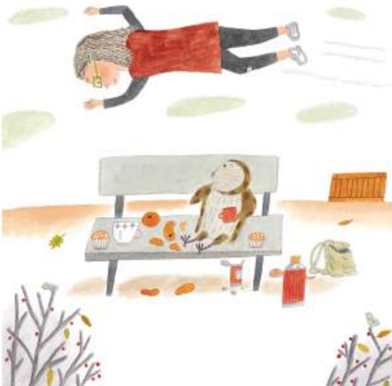
MIN VÄN LAGE

a loyal, solitary woman and an animal, often rather shabby, often not entirely reliable. This motif is developed in Min vän Lage (My Friend Lage, 2001), where a woman describes her sporadic friendship with an owl called Lage who used to work ‘as an owl on several nature programmes’ on television. Now he has a job boring holes. But things aren’t going well and he gets the sack. ‘It couldn’t have been better. It suited him just fine to stop boring now.’ In the last picture, the woman is practising flying, with some success, after taking lessons from Lage. Their friendship never developed any further, as the woman might have hoped, but it did at any rate get her to the point of taking off – or rather: Lage actually taught her the principles for teaching herself to fly.