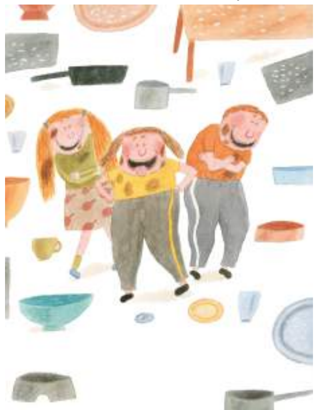
JAG GILLAR STIG

But her friends come to the rescue; they gorge on the chocolate balls together, and in the final picture they are all laughing: