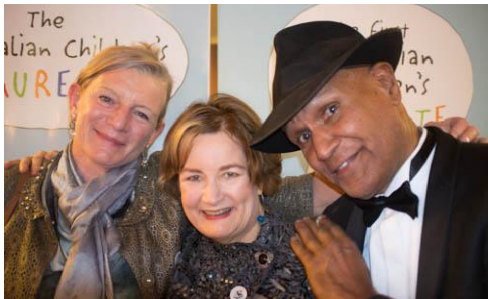
The Three Laureates: Alison Lester, Jackie French and Boori Monty Pryor.

It was with great excitement that the children's literature network in Australia learnt that the 2008 Australian nominee for the Hans Christian Andersen Award for writing, Jackie French, had been appointed as the new Children's Laureate for Australia. The announcement was made at the National Library of Australia on the 27 th November by Rhys Muldoon. Jackie succeeds the inaugural laureate, which was shared by Alison Lester and Boori Monty Pryor.