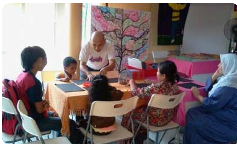
Children participating in art session during the festival