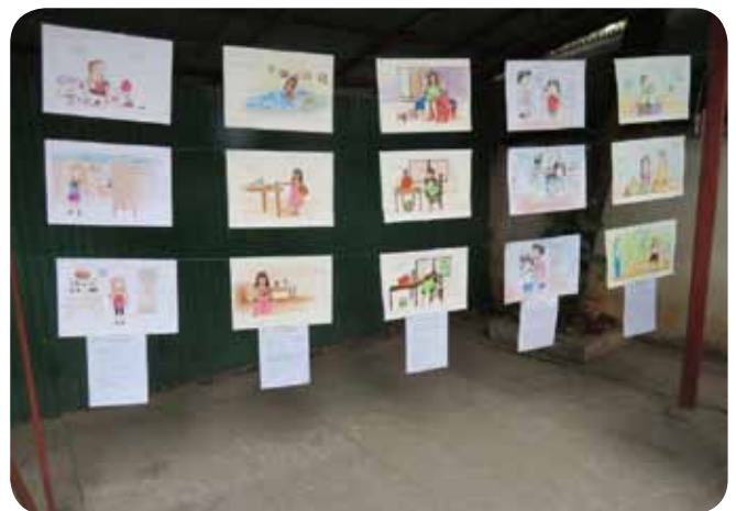
Presentation of the awards for the "Authors and Illustrators for Children Books Competition"