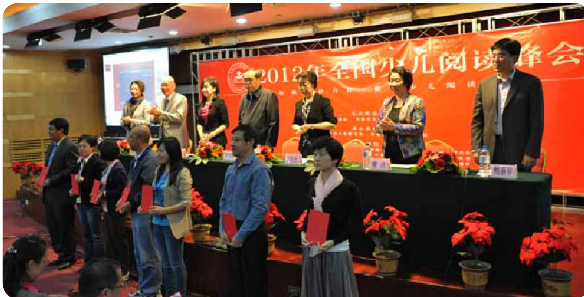
Presentation of Reading Promotion Awards to recipients

A forum on the theme of "How to Strengthen Cooperation between Public Libraries and Publishing Houses", co-organized by China Library Association, CBBY, Library Daily News Paper, and Changchun City Government, as well as Jilin Provincial Library, Jilin Provincial Children's Library was presented on September 21st, 2012. Approximately 600 librarians and publishers from across the country participated in the Forum.