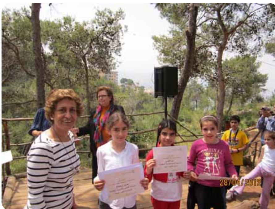
children with certificates

The Reading competition across the country has been already launched. It is a yearly activity that aims at promoting reading among children in 65 schools in Lebanon. This is the first year we use digital means to promote this activity. The competition culminates in a celebration held during the reading week to reward the three best readers from each of the participating schools. Plans are also underway for activities during the National Reading Week for the Promotion of Reading, which will take place the third week in April. During the reading week, several activities are planned by the Ministries of Culture and Education as well as schools and NGOs across the country.