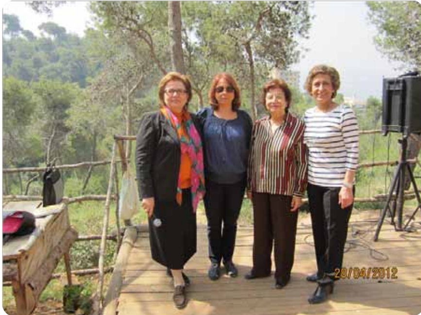
members of IBBY

Last but not least, a facebook page has been developed to broaden visibility. The link to that is: https://www.facebook.com/lbby.lbby?fref=ts