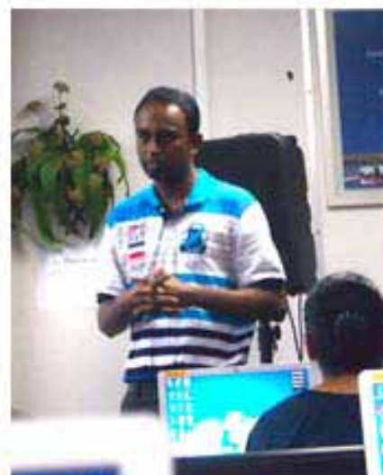
Participants at the E-Book Workshop