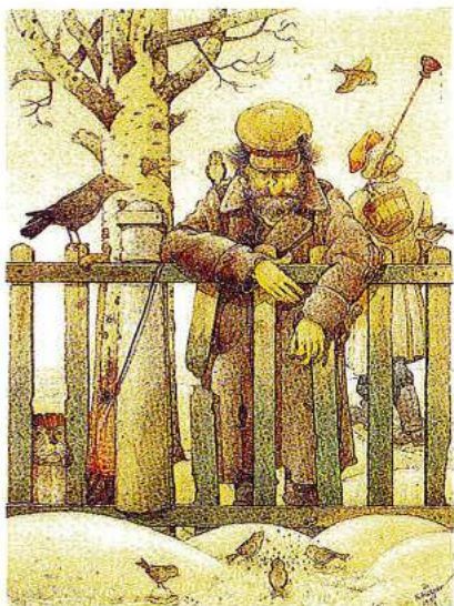
The Honest Thief