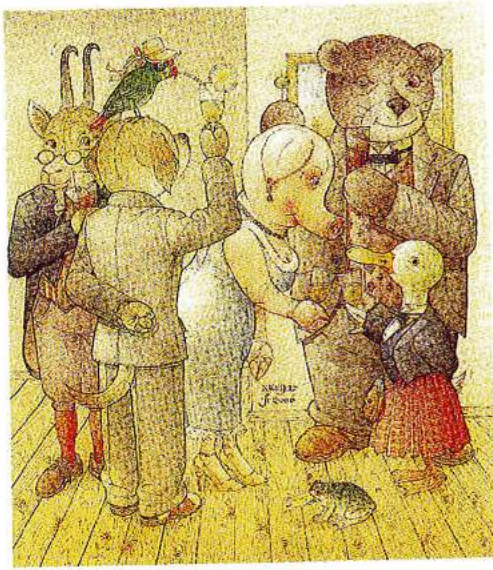
The Missing Picture