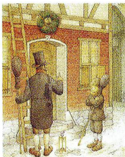
The Last Chimney of Christmas Eve

to escape the limitations of their existence, and making connections with a world outside the home, the world of the imagination.