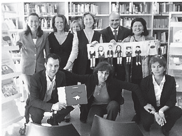
At the Biblioteca Ennio Flaiano.