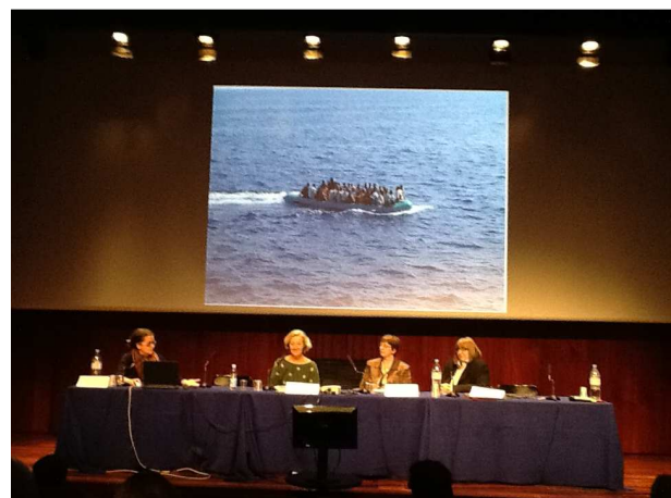
Presentation of the project at the 3 rd European Encounter on Children’s Literature, Paris, 30.11.2012