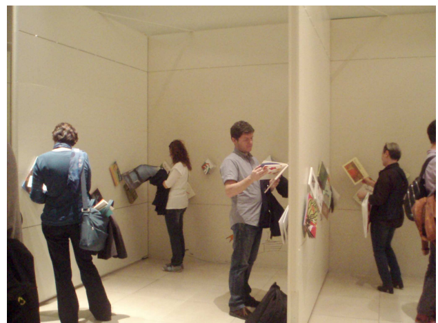
Opening of the exhibition “Silent Books: Final Destination Lampedusa”, Palazzo delle Esposizioni, Rome, 07.05.2013

The exhibition in Rome lasted till 21 st July 2013: during this period, many children could visit the collection and the museum organized many workshops and training events for teachers too.