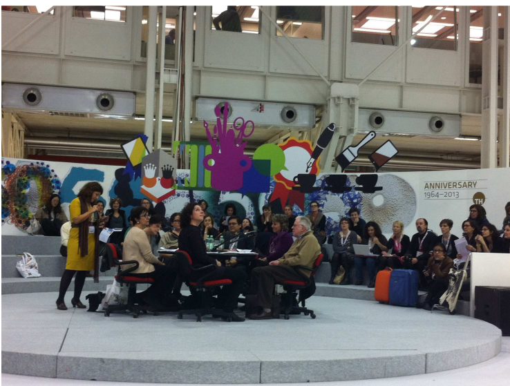
Silent Books - honour list presentation at the 50 th Bologna Children's Book Fair, Bologna, 27.03.2013