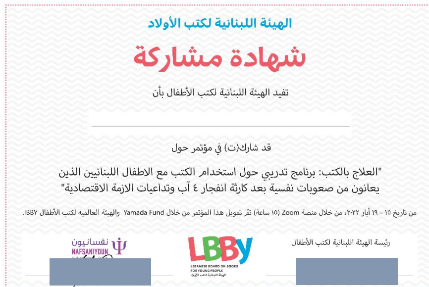
Figure 3: The certificate distributed at the end of the project