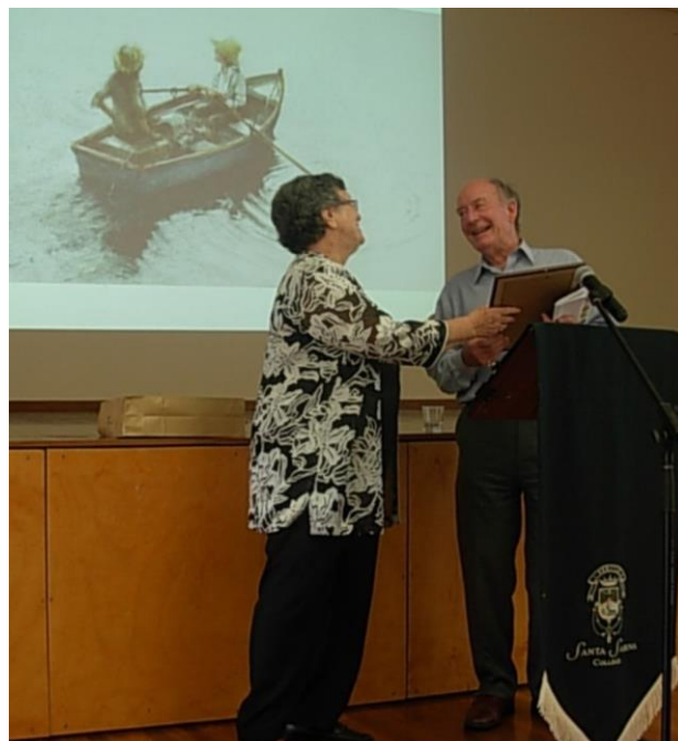
A highlight: Presenting Robert Ingpen with his Life Membership of IBBY Australia certificate on the 5 th April, 2014