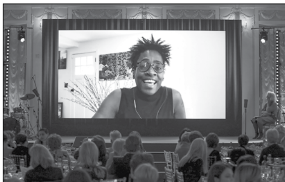
Jacqueline Woodson, HCA 2020 author winner