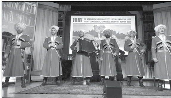
The Moscow Cossack Choir

The whole Congress was a great and important achievement. A huge and heartfelt thank you goes to everyone at Russian IBBY/Raising Readers for preparing such an interesting, wide-reaching, and thought-provoking event.