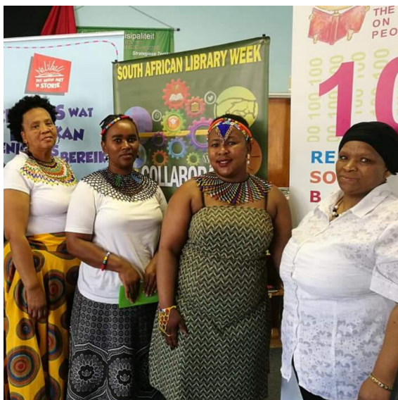
Literacy Month celebrations in De Doorns, with the local library and our partners to realize the right of every child to become a writer.