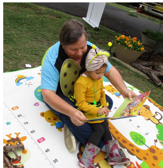
IBBY SA welcomes Spring with Grandpa Farouk's Garden, Cake and Drawing In The Park in Grassypark, Cape Town on 21st of September.