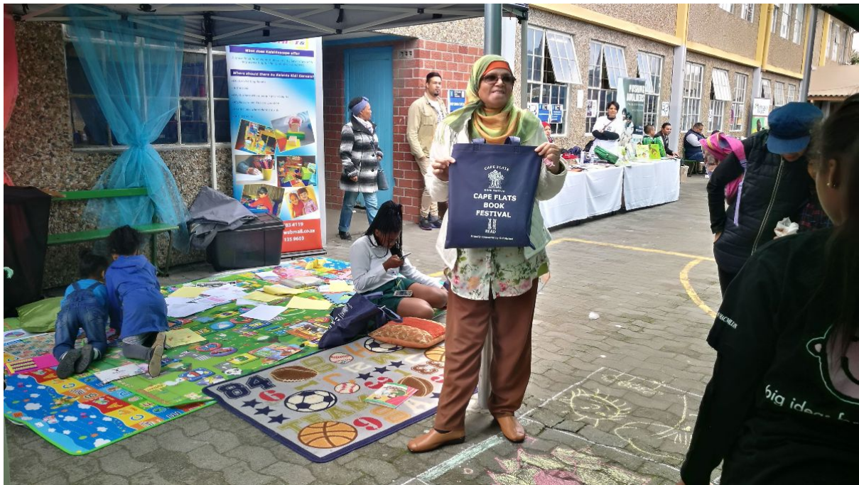
The Cape Flats Book Festival hosted by Read to Rise in Mitchells Plain, Cape Town from 31 August to 1 September 2019.

We share a few snapshots from some of the events we were part of this past year.