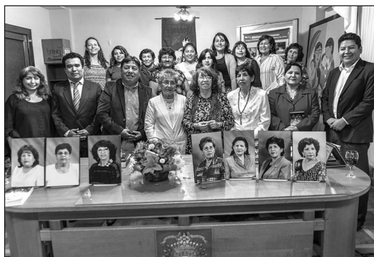
Members of IBBY Bolivia