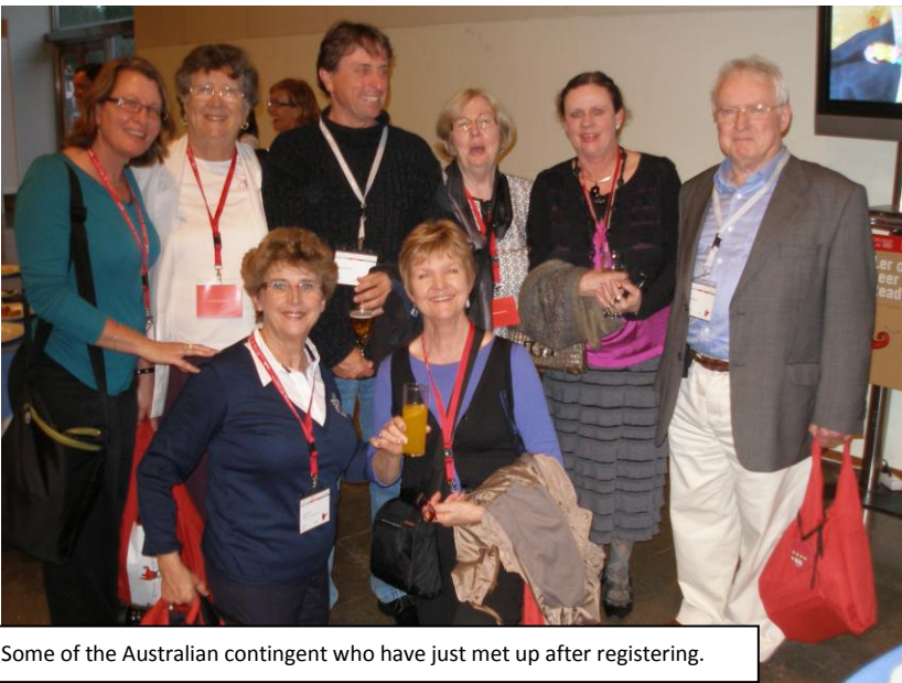
Some of the Australian contingent who have just met up after registering.