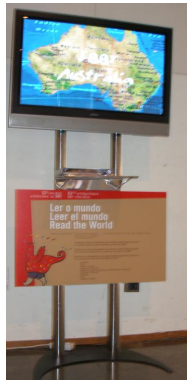
Read the World photographic exhibition and the Australian contribution