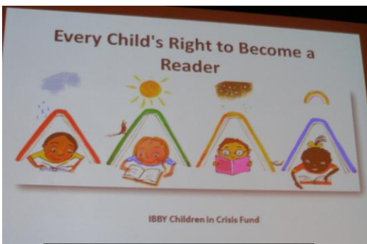
IBBY Children in Crisis promotion