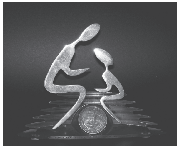
The Nelson Mandela Award