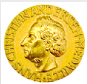
Hans Christian Andersen Medal

The announcement of the winners will be made at the Bologna Bookfair March 30 th – April 2 nd 2020 .