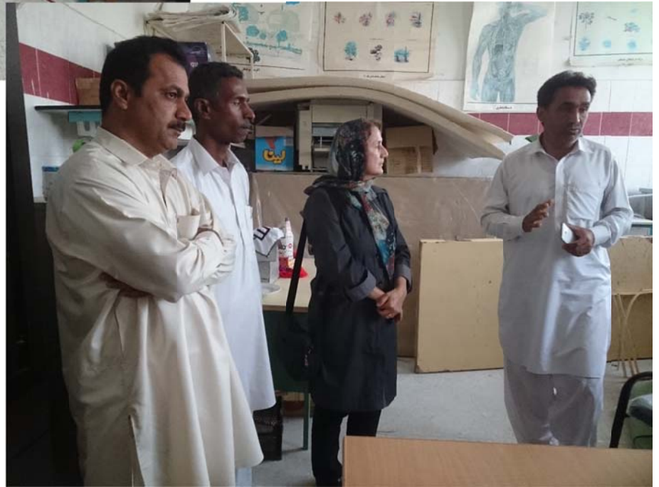
Koorsar region in the town of Ghasr e ghand: