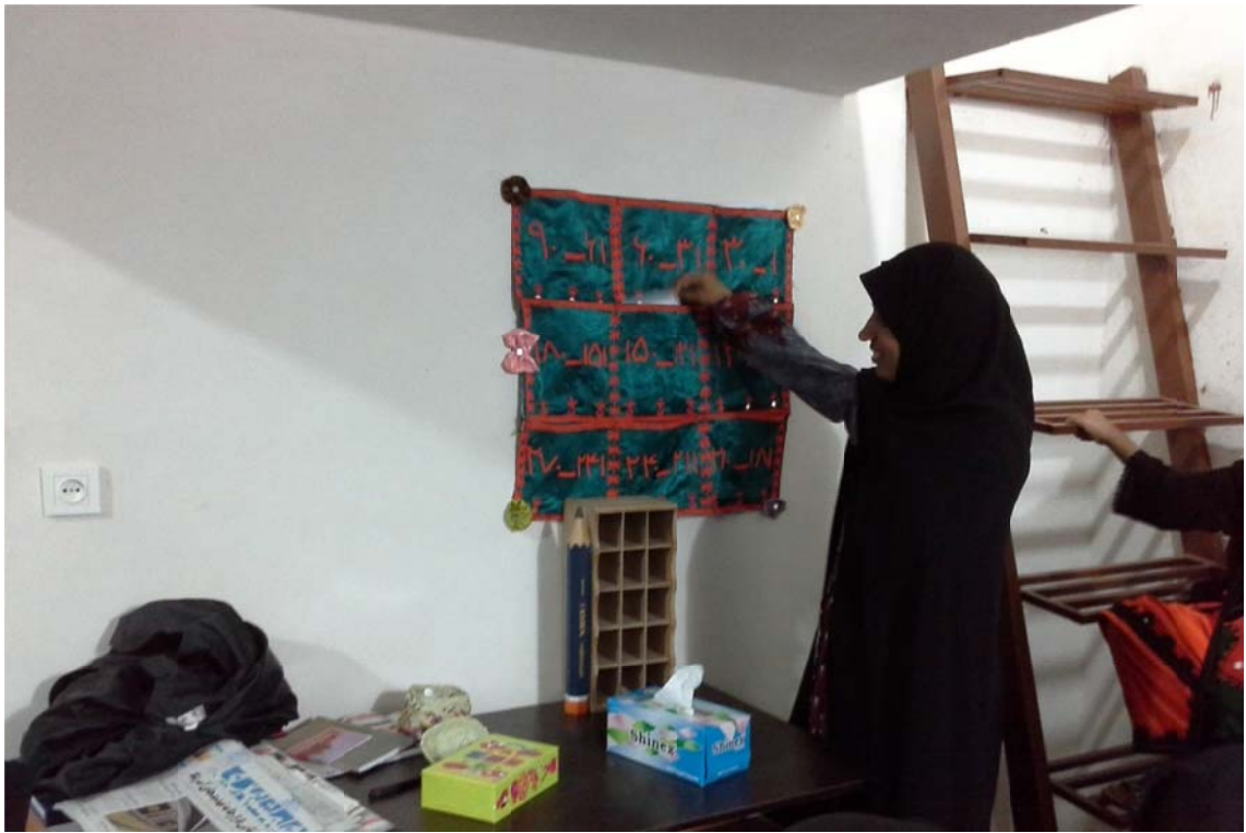
-Images related to active participation of children and adolescents: