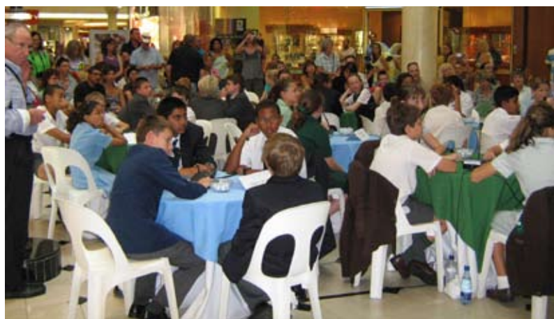
The SA Kids' Lit Quiz finals at Exclusive Books, Tygervalley