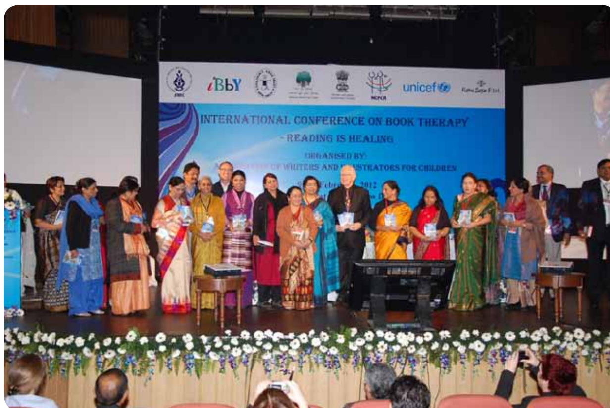
9 - 11 February, 2012, New Delhi, India