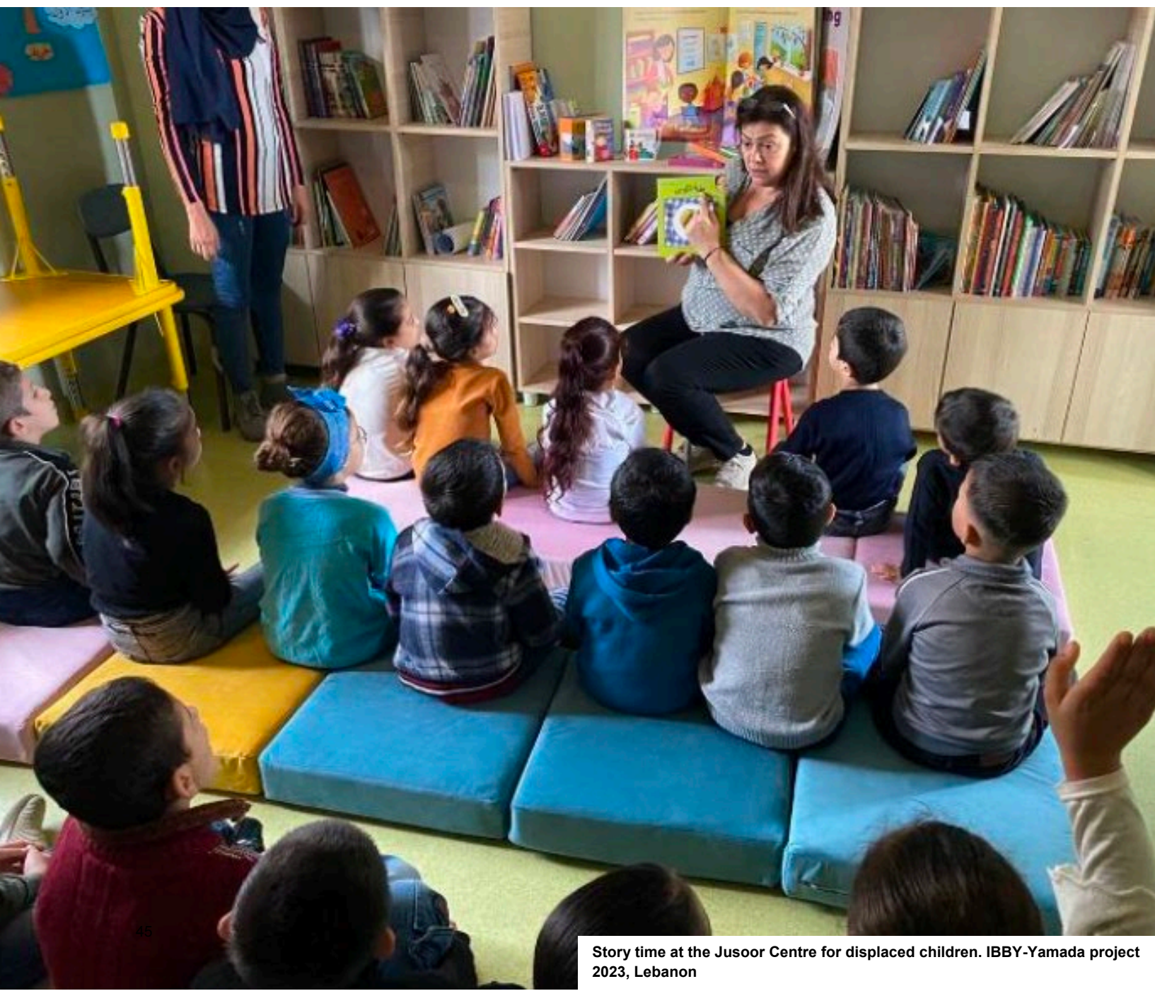
Story time at the Jusoor Centre for displaced children. IBBY-Yamada project 2023, Lebanon

Empowerment, through workshops and training, of talented and interested local authors to produce relevant books.