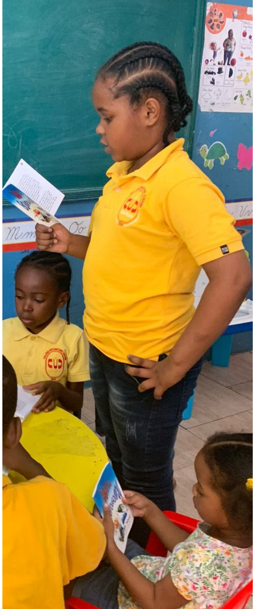
Reading programmes for displaced children, IBBY-Yamada project 2023, Haiti