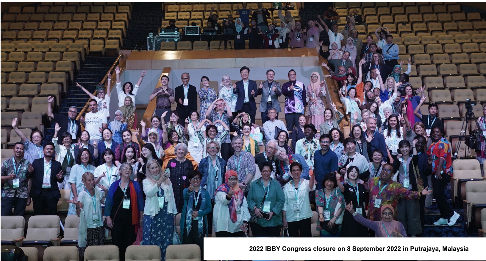
2022 IBBY Congress closure on 8 September 2022 in Putrajaya, Malaysia

IBBY Italy will host the 39 th IBBY Congress in Putrajaya, Malaysia from 30 August to 1 September 2024. Theme: Join the Revolution! Giving Every Child Good Books.