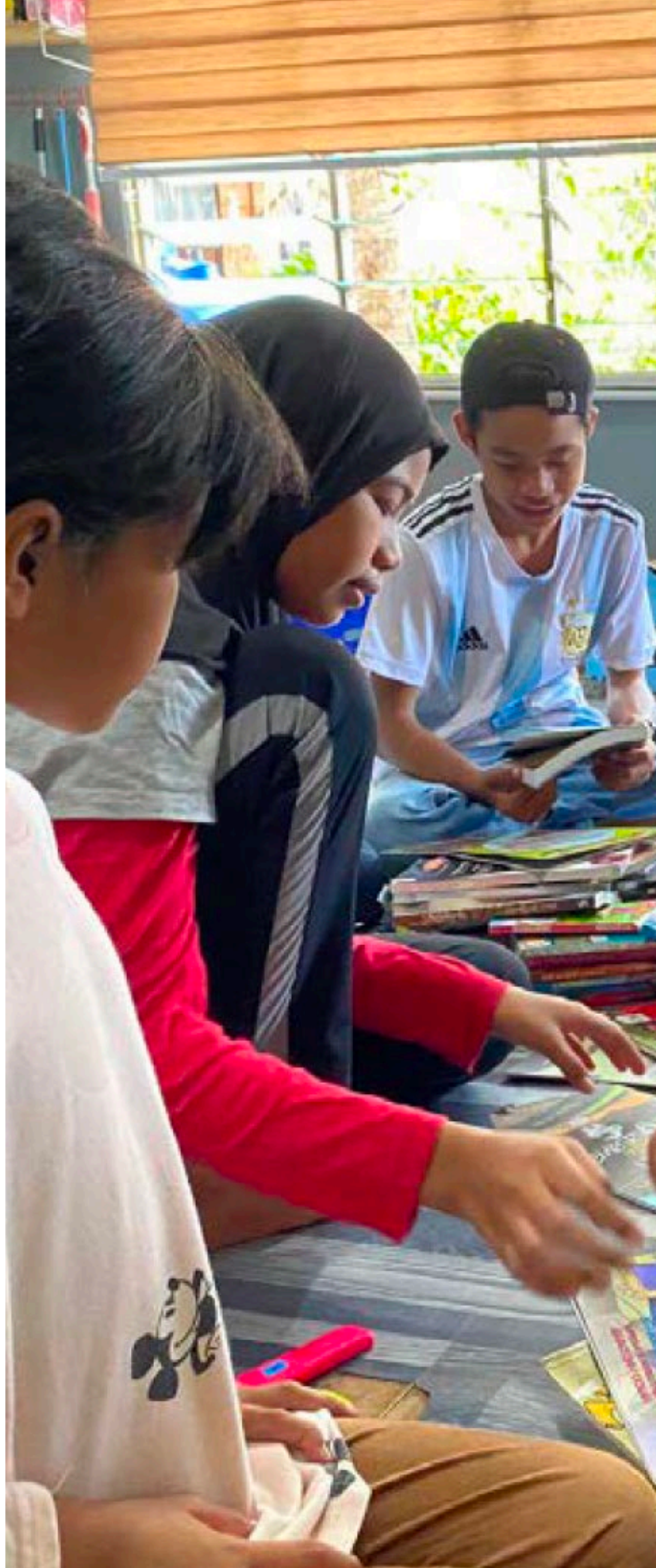
Everyone contributes to the preparation of a Reading corner in Tawau, Borneo. IBBY-Yamada project, Malaysia 2022.