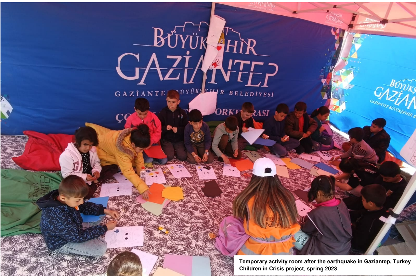
Temporary activity room after the earthquake in Gaziantep, Turkey Children in Crisis project, spring 2023

In the days following the natural disaster, the Turkish Section of IBBY started working to establish temporary libraries in the affected provinces of Gaziantep, Hatay and Adana. While negotiating the administrative authorizations for the launch of the project, IBBY Turkey purchased over 5,000 books in Turkish and Arabic, as well as stationery, story boxes and educational board games. The material was archived, classified, labelled, and transported to Gaziantep by truck, to be stored in Gaziantep and used as need emerge. Writers and illustrators who had volunteered to visit the affected areas received two trainings on bibliotherapy and expressionist art therapy.