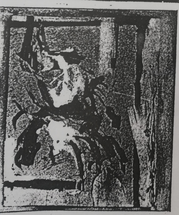
"Dimensions VI", mixed media by Dora Orontientou.