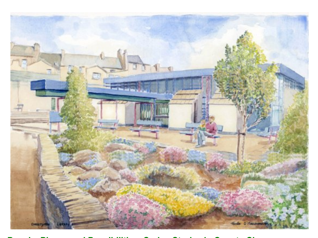
People, Places and Possibilities: Syrian Stories in County Clare

Syrian families living in County Clare have been storytelling, writing and illustrating in a project funded by IBBY Ireland, Clare Libraries and Poetry Ireland. 'Connections' has brought children and mothers together from Scoil Mhainchín in Ennistymon to weave stories, recall their own experiences in Syria, Lebanon and Ireland, and dream their futures. As well as developing literacy, the family groups have built oral skills through games and activities, with children often translating for their parents. Their work will be printed in a booklet and launched in January at Ennistymon Library.