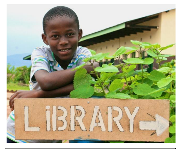
Library sign in South Africa.

Since 2000 Room to Read, an innovative and dynamic global non-profit, has been focusing on literacy and gender equality through education, building schools, establishing libraries, distributing books, developing and delivering holistic literacy and girls' education programs. Room to Read works in ten low-income countries in Asia and Africa. By the end of 2015, it had