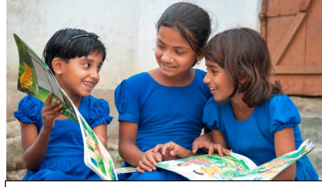
3 girls reading together in Bangladesh.

blighting the lives of so many people, there would