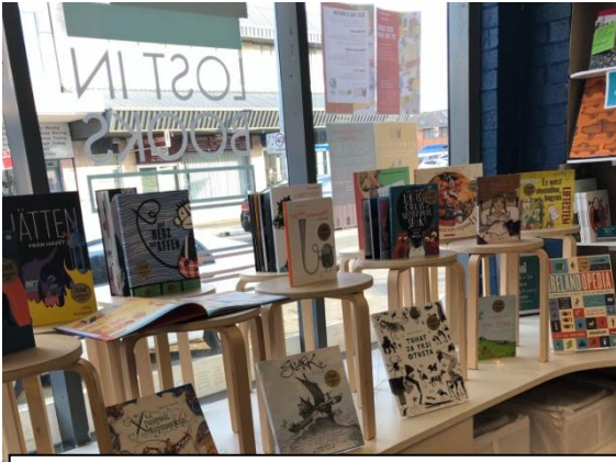
Some of the 2018 IBBY Honour Books exhibition on display at the launch in the Lost in Books shop in Fairfield.

Lost in Books made the Honour Book display look very special. They paid to have several of the honour book covers reproduced to A1 size (50X84cm) which they suspended from the soiling