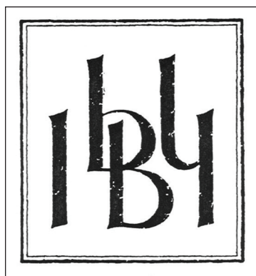
IBBY logo 1985–1992