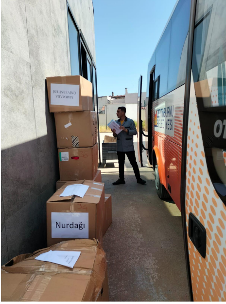
Our materials stored in Gaziantep Metropolitan Municipality Panorama Museum warehouse.

We collaborated with an organization named Güneş Adalar , which established children's centers in container cities in Gaziantep, Kahramanmaraş, and Hatay. In Islahiye district of Gaziantep , one of the most affected districts, we set up a library in the children's center within Güneş Adalar container city. Reading activities are organized for children who lives in container cities in the 500-book library. There is a teacher appointed by the Ministry of National Education who also reads stories in the library every day. Our members, the authors and the illustrators, visit this center and conduct art and reading activities.