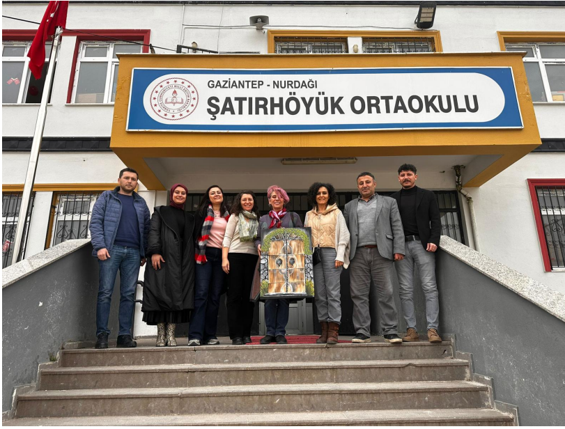
Şatırhöyük village school of Nurdağı district in Gaziantep