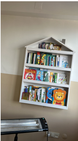
Preschool class library, Şatırhöyük village school.