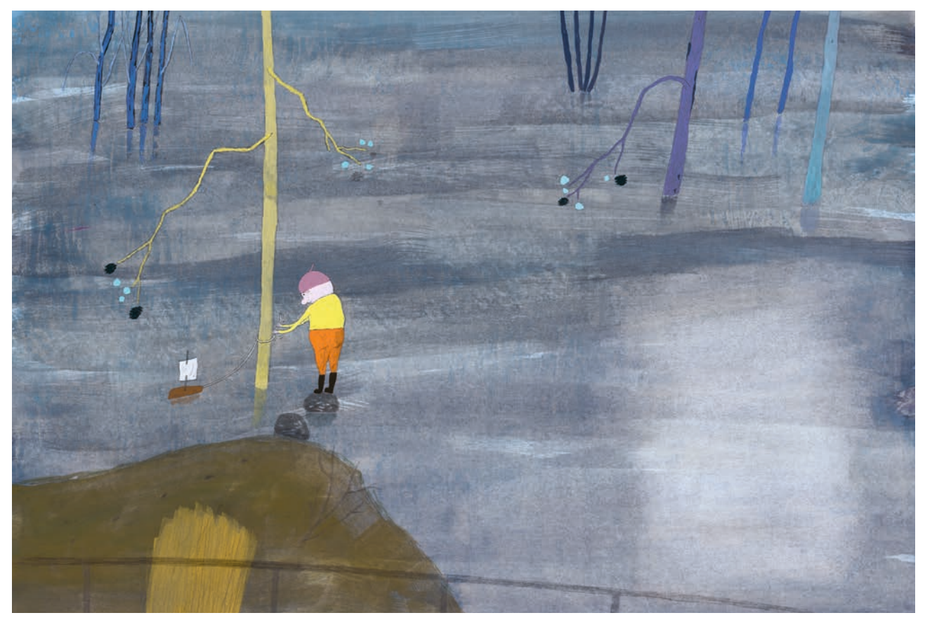
JAG TYCKER INTE OM VATTEN

I think it is a mix of coexistence and insecurity in the pictures. Where are we? What are we doing? And I also think that the coexistence between nature and the characters is perhaps a way of fixing one spot where one can take a deep breath and feel a bit hopeful. I try hard to be hopeful.