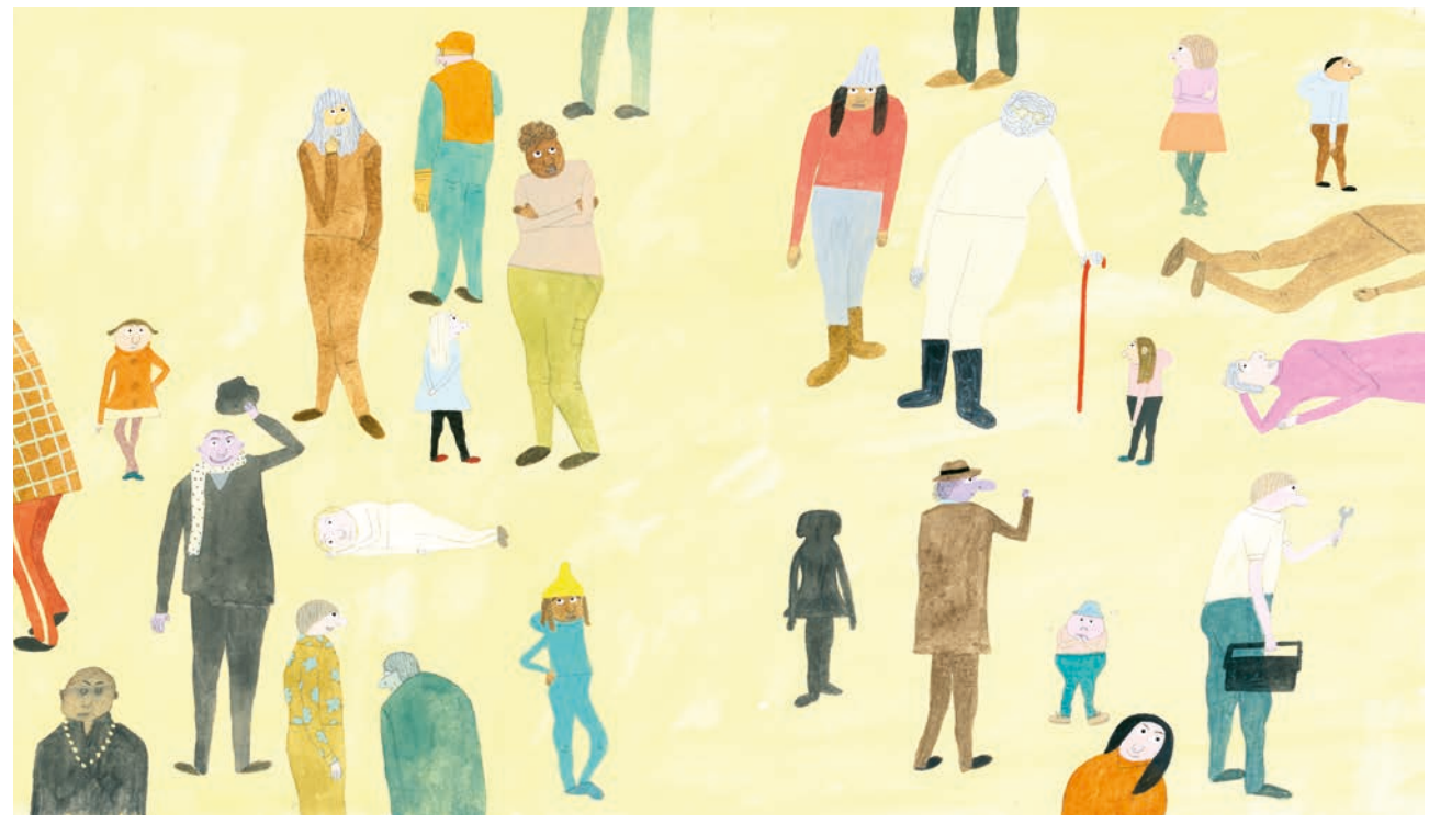
HIT MED VÅRA MÖSSOR!

ity we cannot keep under control, where things disappear and reappear, where trees leave and come back, where we go on a trip and suddenly the atlas is not useful anymore. For your characters everything seems possible. Is that so? Why?