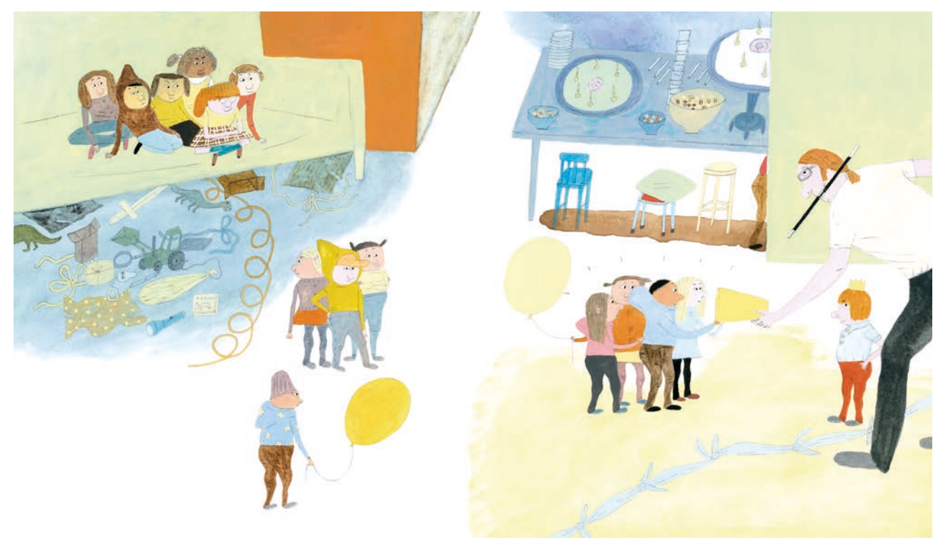
HIT MED VÅRA MÖSSOR!

as a reference is the films by the Kaurismäki brothers.