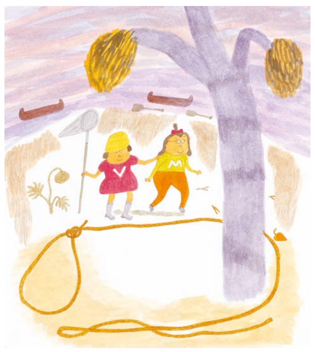
VILMA OCH MONA SPANAR OCH SMYGER

We encounter the same tone and the same frenetic activity in a number of Lindström's other books, where children's wild games provide insights into children's concrete thought processes, described by Piaget as 'transductive': children jump from one specific thing to another in an entirely unpredictable way. In Lindström's comically absurd picture book Vilma och Mona spanar och smyger (Vilma and Mona Go Sneaking and Spying, 2002), the two girls are caught up in the world of their own imaginations. They hunt out things that seem to be lost, or misplaced, and even some that are not yet lost, but look likely to be. They want to 'help' at all costs. They pinch an orange cap from an old man's head. 'We could see a mile away that the cap was missing. The cap had vanished. We could see that, plain and clear. And they find another man, on a bench, and move him because he looks lost: