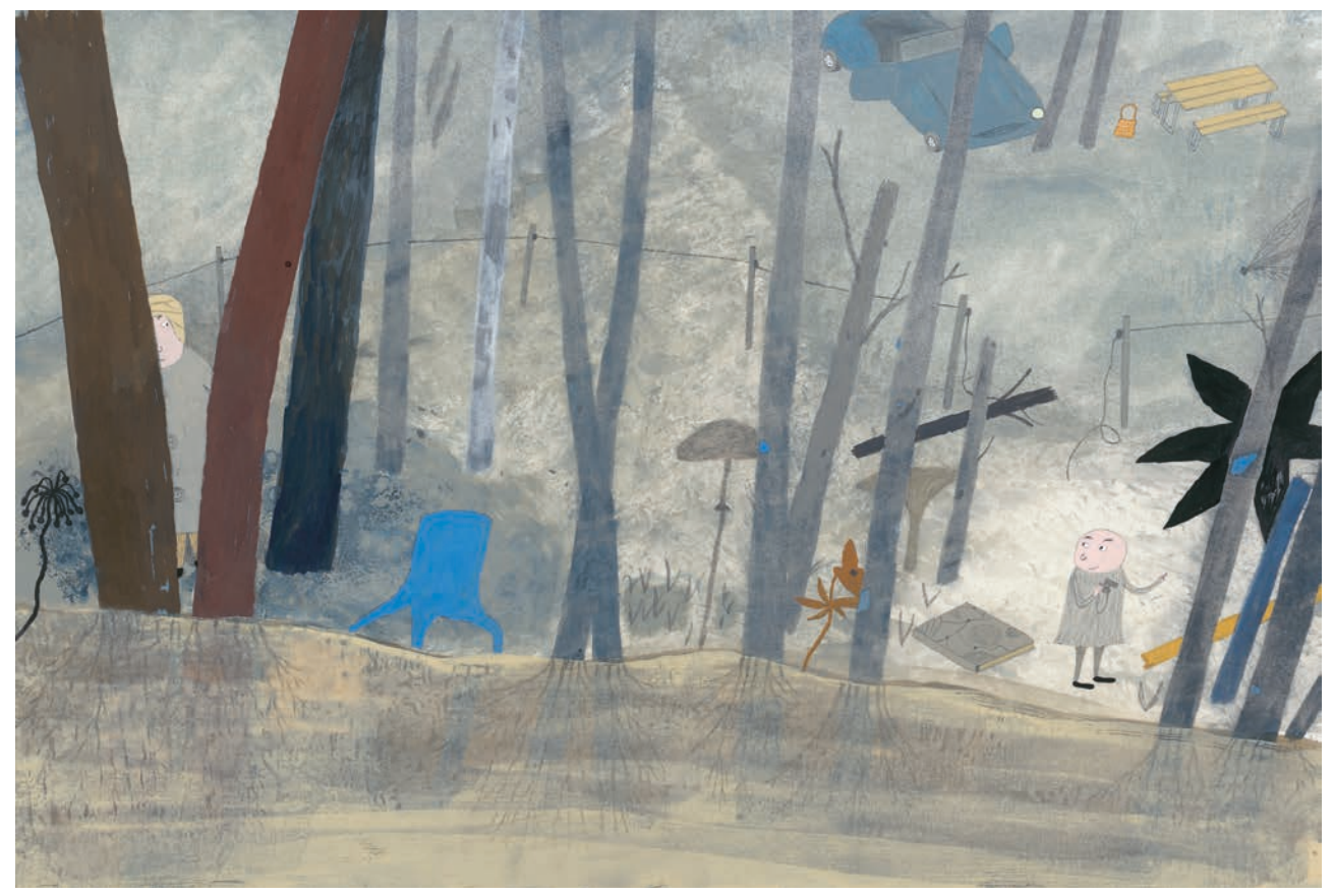
OLLI OCH MO

Mo starts the car. She puts her foot on the accelerator and they zoom off. 'Where are we?' she cries after a while. Olli leafs through the road atlas. 'We'll soon be on the outskirts of page three.