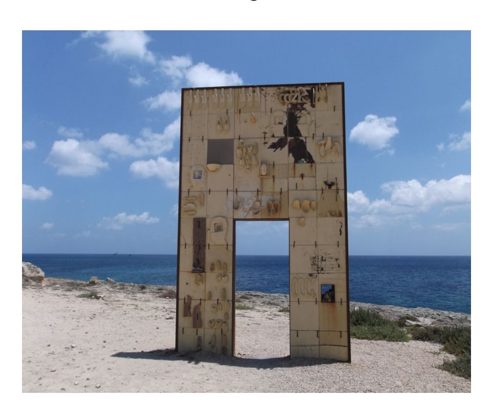
Everybody is Welcome!