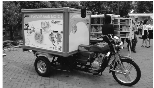
One of the three Motorbike Libraries donated by the IBBY-Tsunami Fund.

the island of Nias, which was also devastated by the 2004 Tsunami.