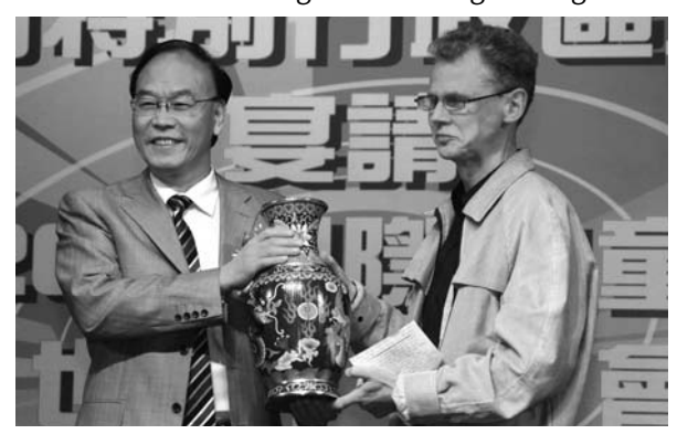
Hai Fei passing the "baton" onto Vagn Plenge

The closing ceremony also included the traditional invitation to attend the next IBBY World Congress. The Congress organizers IBBY Denmark gave a visual presentation of the 31st IBBY Congress in Copenhagen in 2008. Hai Fei , President of CBBY presented Vagn Plenge , one of the Congress 2008 organizers, with a Chinese vase as a symbolic passing over of the task of being an IBBY Congress Organizer.