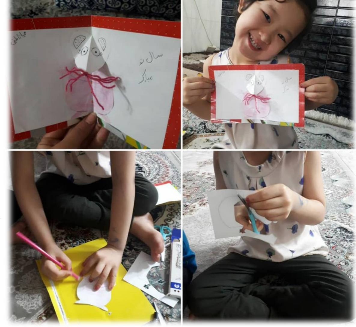
The Supportive Education Center of MahmoudAbad

In marginal and underserved parts of Tehran, more than 200 mothers from 4 different supportive education centers cooperating with read with me, are involved in such activities. They receive online guidances , and do the activities at home with their children