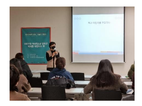
Honour List Lecture