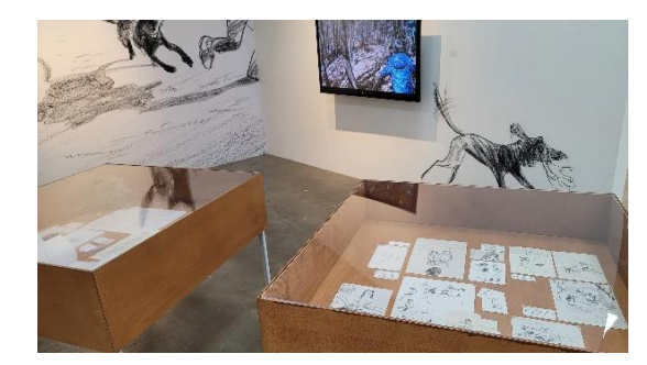
Exhibition of Illustrator Suzy Lee's Original Artwork