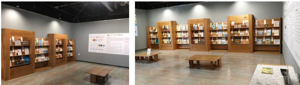
Exhibition at the Suncheon Picture Book Library

This was a precious opportunity for the Korean people, inspiring many researchers, publishers, and writers in Korea. Though amidst difficult circumstances, efforts were also made to foster exchange and dialogue between publishers, writers, educators, and researchers including an ZOOM online seminar organized in collaboration between KBBY, Gunpo City, and the Korean Society of Children's Literature & Education.