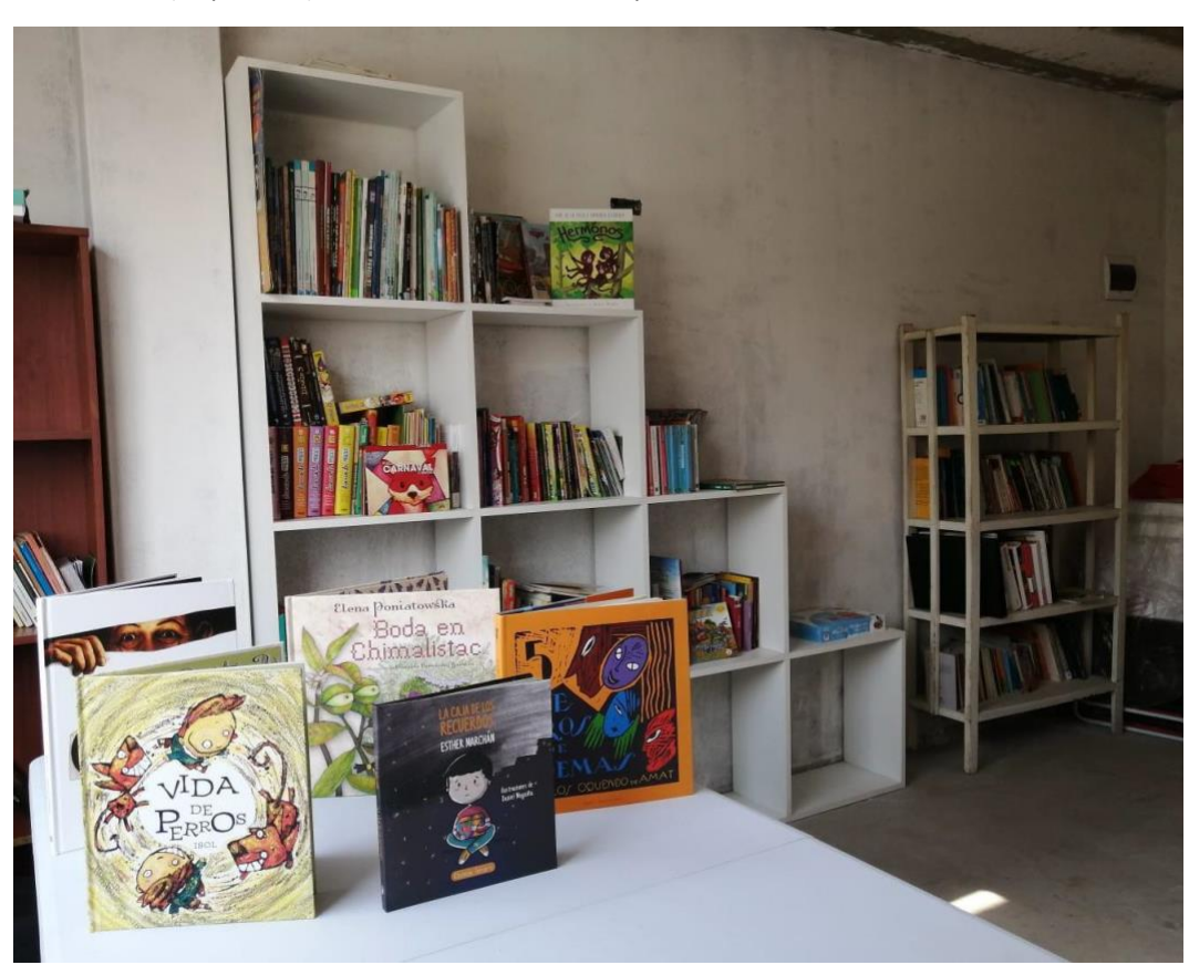
Reading room implemented on the second floor of the Yauri Condo house in Horacio Zeballos

Due to the capacity of the room, the activities cannot receive more than 15 users at a time. For this room, bookshelves, a desk, a swivel chair, two large folding tables and 15 folding chairs were purchased. The decision for the last two to have these characteristics was made in order to be able to have free room for other types of activities, such as storytelling and film screenings.