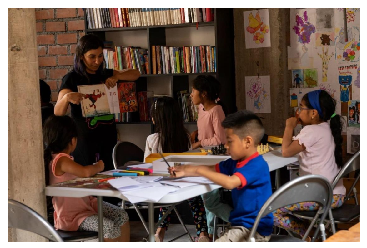
Reading room in Virgen de la Candelaria Moya, 2022