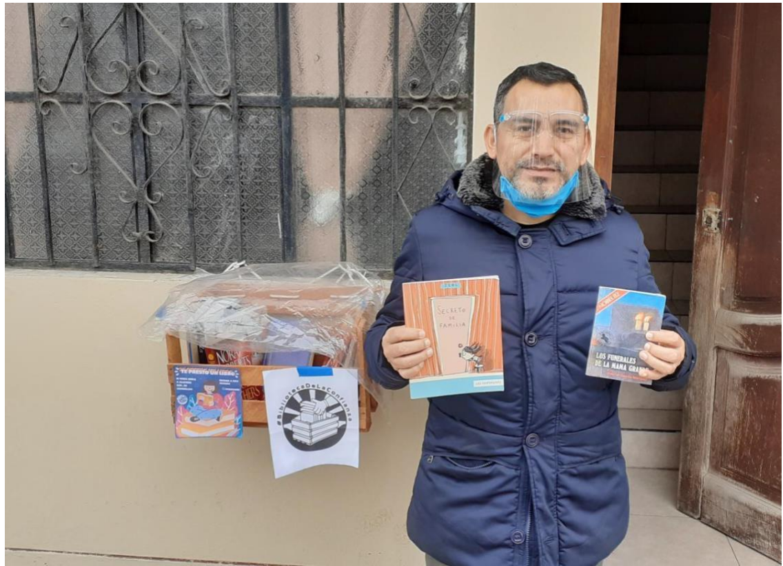
User of the Biblioteca de la Confianza located in Alameda Sur, Chorrillos.

This project, whose initial infrastructure consisted in the use of a wooden fruit box as a bookcase, kept its original concept as it is a container that transports and contains a basic necessity and likens the value of food to that of books. This box was installed on the facades of some houses or in spaces on public roads, always outdoors, facilitating free access to books and appealing to the trust of users, who reported the loan of books by text message or WhatsApp. Additionally, since September 2020, we implemented reading points in four common pots / soup kitchens in Villa El Salvador, Puente Piedra, San Juan de Miraflores and San Miguel.