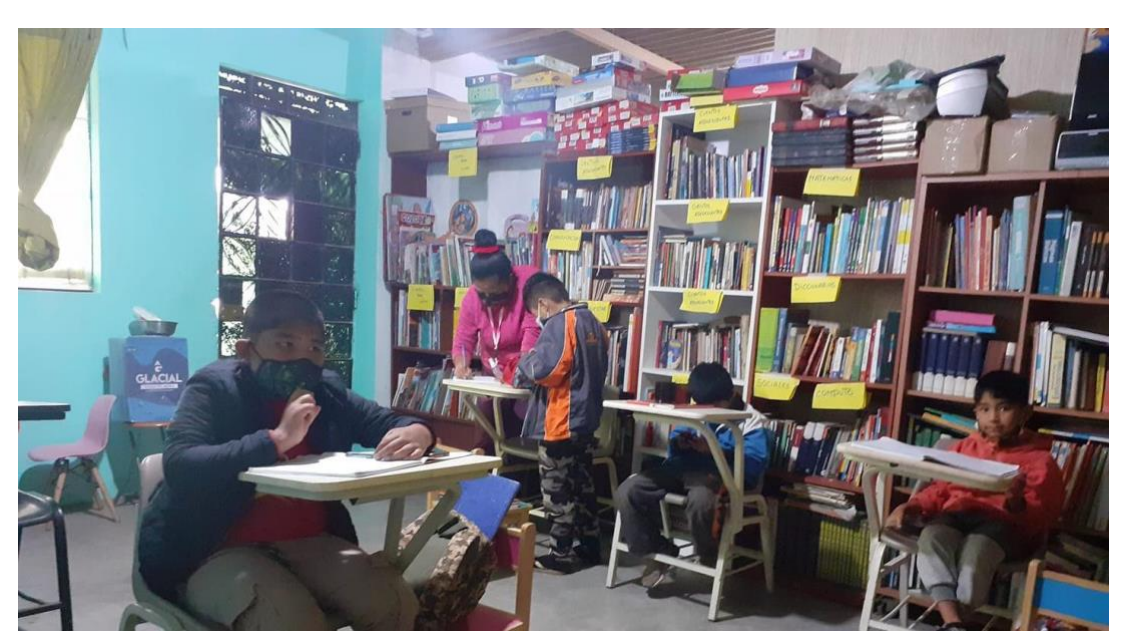
Reading room in Lomo de Corvina, 2021

This reading room is 40m2, which allows for a larger amount of books and furniture. However, before the Yamada project intervention, some of the furniture was in poor condition. The deteriorated shelves were replaced to reorganize the collection, as can be seen in the following images.