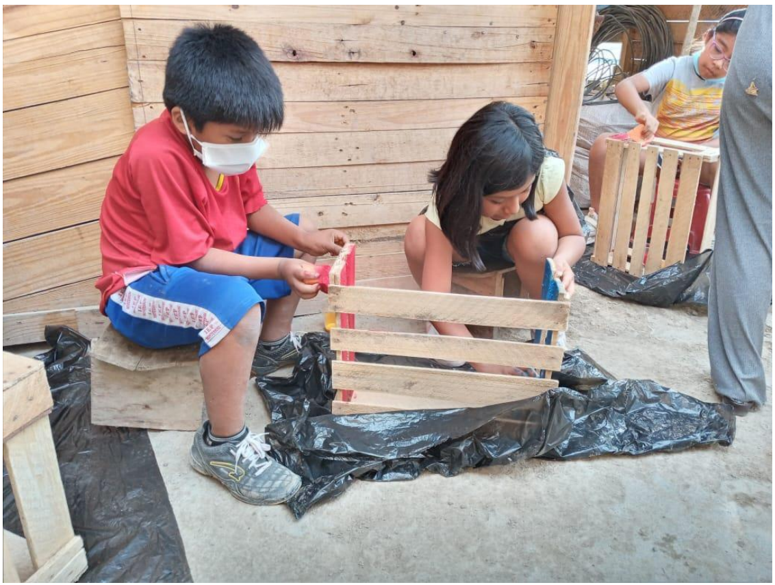
Children of the Puente Piedra Trust Library, preparing the boxes.

For IBBY Yamada's funding, we selected the spaces that had the greatest influx of public and are more constant in their activities. These are located in vulnerable districts of the province of Lima, e.g. Lomo de Corvina (Villa el Salvador), Virgen de la Candelaria Moya (Puente Piedra) and Horacio Zeballos (Huaycán, Ate).